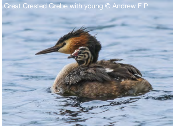
Great Crested Grebe with young