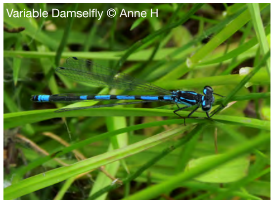
Variable Damselfly

Then we crossed the railway line into the reserve proper where, in the shelter, we saw all three of the small blue damselflies – (the not so) Common Blue, Variable and Azure. On the path, we found some nice Southern Marsh Orchids and some Common Spotted Orchids and some that looked as though they could be hybrids of the two. Onto a little section of boardwalk, we found our first examples of the Milk Parsley that is the Swallowtail's foodplant. The plants were very small and late to grow this year, and it was no surprise to find no eggs nor caterpillars on the leaves, despite a thorough search. There were some nice fen plants on this section of the reserve including Purple Meadow