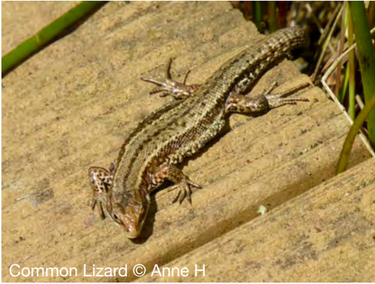
Common Lizard

Rue, Bog Myrtle (with its lemon-scented leaves) and Marsh Pea. We also found a Common Lizard on the boardwalk and it was a testimony to the low temperatures that it hardly moved.