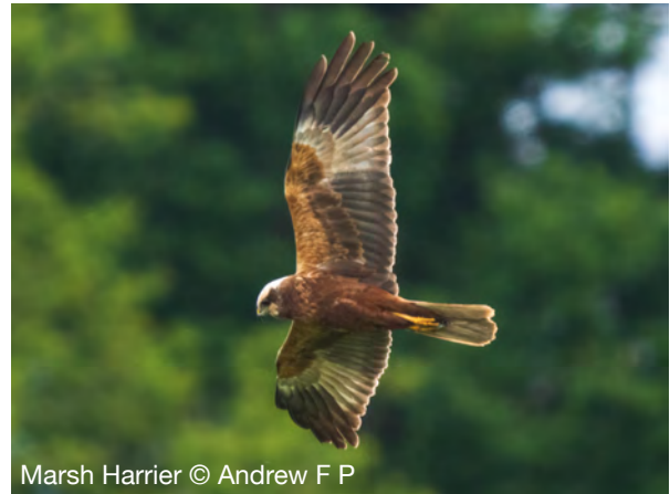
Marsh Harrier

We had good views of a Scarce Chaser and lots of Banded Demoiselles, both male and female, before we glimpsed a Large White butterfly from the hide. Here we enjoyed some fabulous views of Marsh Harriers, enjoying what was an increasingly windy day, and using the wind to slow their progress over the reeds in search of Water Vole and other prey.