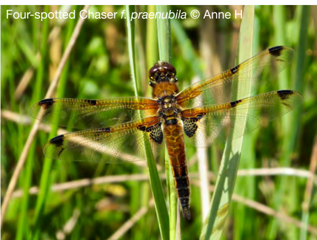
Four-spotted Chaser f. praenubila