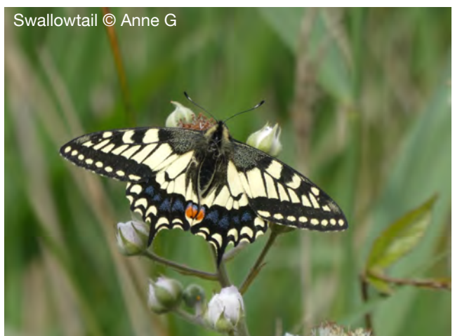
Swallowtail © Anne G