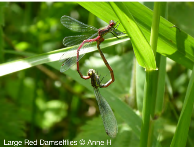
Large Red Damselflies