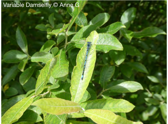
Variable Damselfly