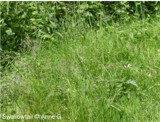
Swallowtail © Anne G