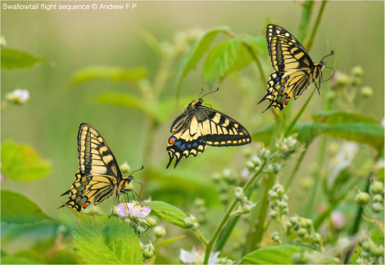
Swallowtail flight sequence