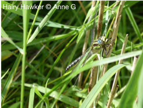
Hairy Hawker