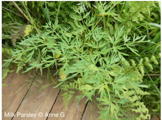
Milk Parsley