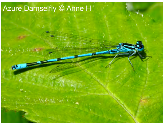
Azure Damselfly