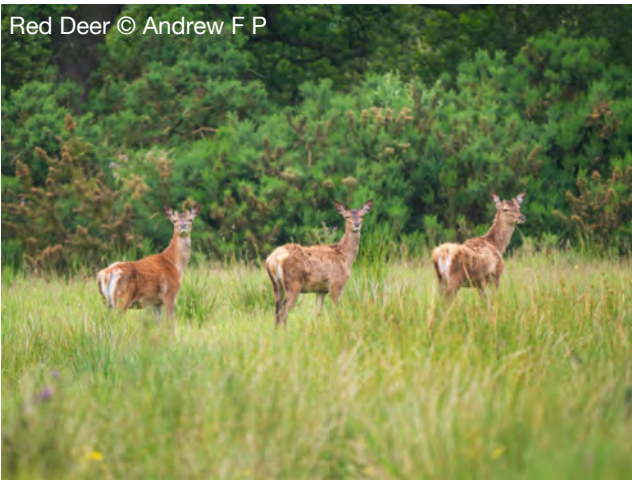
Red Deer © Andrew F P