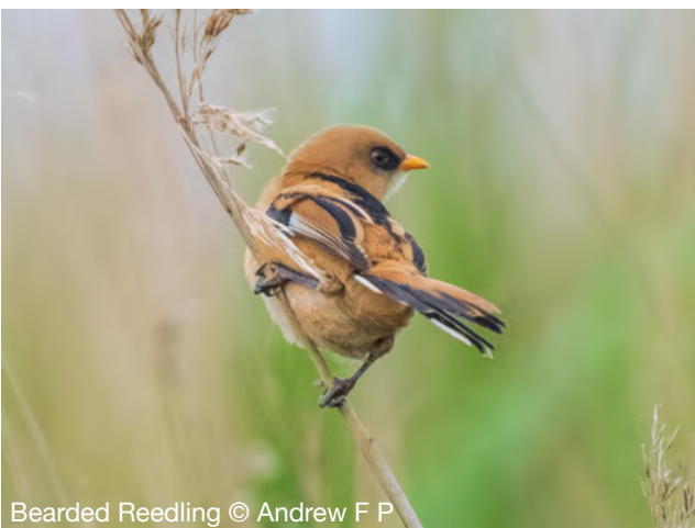
Bearded Reedling