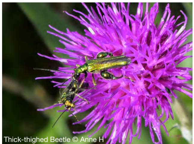
Thick-thighed Beetle