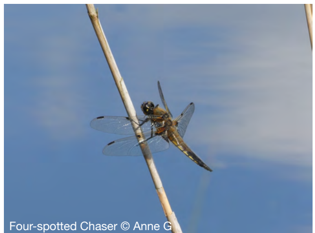
Four-spotted Chaser