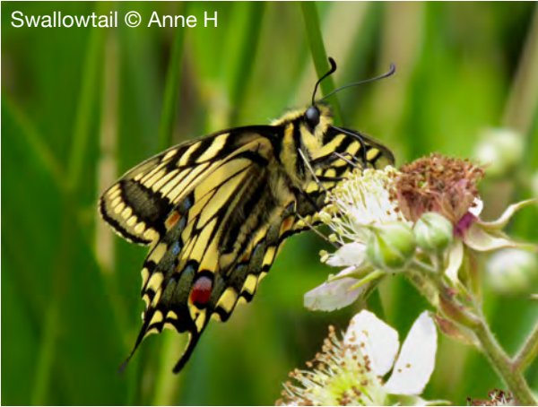
Swallowtail © Anne H