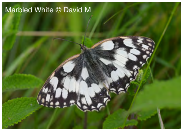
Marbled White © David M

Germander that were later identified as Silver Y moth. A female Broad-bodied Chaser was zigzagging over the grasses at head height, hunting for insects, and we could hear Green Woodpecker, Long-tailed Tits and Blackcap. Heading into the wooded edge of this glade, thick with oaks and willows, to look for Purple Emperor, Richard and Kat saw a White Admiral flit by; there was plenty of Honeysuckle, their larval food plant, draped over the trees and other plants and even over the woodland floor. We checked the woodland ride of oaks and willows but to no avail. We continued down a wide, grassy woodland path and, just as Pete was asking whether we