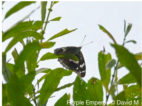
Purple Emperor

As we parked in the car park, some of the cattle, brown and cream Old English Longhorns, were grazing nearby, and as we walked into the 'Wildland', we were greeted by a ginger Tamworth sow and her four adorable piglets, as well as a few of the White Storks. We headed straight for the part of the estate where all the fabulous footage of the Purple Emperor in David Attenborough's 'Wild Isles' was filmed. Here, in spite of the gusty, grey conditions, we saw our first Purple Emperors, territorial males high in the oaks, as well as Purple Hairstreaks. We also saw rare White-letter Hairstreaks in a small English Elm and adjacent Field Maple. Moving on, we saw plenty of male Purple Emperor activity high in the oaks as well as 'sallow-searching' – hunting for freshly emerged females in the willows. Heading on down the track, we saw a fairly obliging female resting near the top of a small willow quite near the track. Eventually, we returned along the track, stopping to see some more male action on the way back. Naturally, as it was almost time to leave, blue sky and sunshine finally appeared! At our final stop for Purple Emperor spotting, there was a Gatekeeper lurking in the hedge and a punky-looking Knot Grass moth larva munching the undergrowth (many apologies for not recording and crediting the spotters of these!). Then we returned to our vehicle and headed back to Burgess Hill train station.