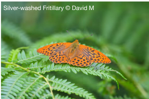
Silver-washed Fritillary

might see any fritillaries, and Kat was responding that there were Silver-washed Fritillary in this wood but she didn't hold much hope of seeing them in the current weather conditions, there was a yell of "Silver-washed Fritillary!" behind us from Richard and there indeed one was, and posing beautifully! It floated about gracefully for a few minutes, pausing to pose at regular intervals, and affording everyone a wonderful close-up view. When it eventually fluttered away into the wood, we carried on down to a pond, normally good for dragonflies. David spotted (!) a big group of magnificent, tall spikes of