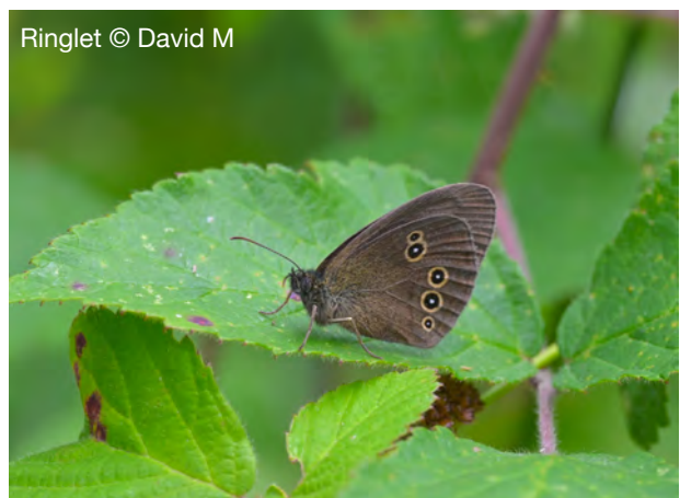
Ringlet © David M