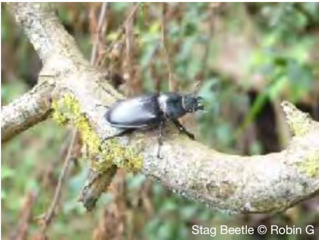
Stag Beetle