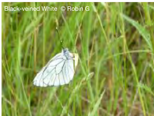
Black-veined White

number of Black-veined White butterfly as well as a gorgeous Dainty Bluet damselfly. Over a couple of shrubs, a Corn Bunting was very obliging and was soon joined by a second one, offering us good views of their conspicuous plumage and strong bills.