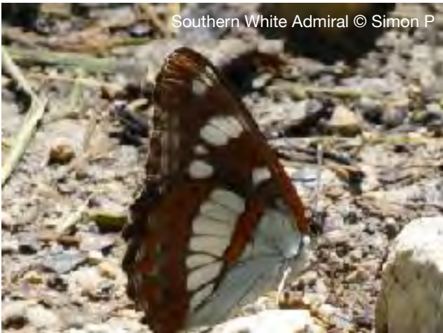
Southern White Admiral © Simon P