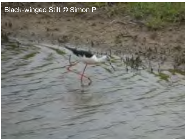
Black-winged Stilt