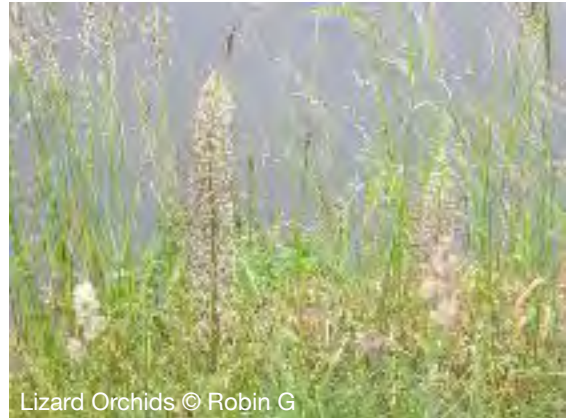
Lizard Orchids

Our next stop of the morning was a botanical one. On the side of a cross roads, we encountered Pyramidal Orchid, Greater Butterfly Orchid, Bee and Lizard Orchid and our very sought after Man Orchid! Judy also spotted a Garden Tiger Moth, Nick a Marbled White and Simon a Marbled Fritillary.