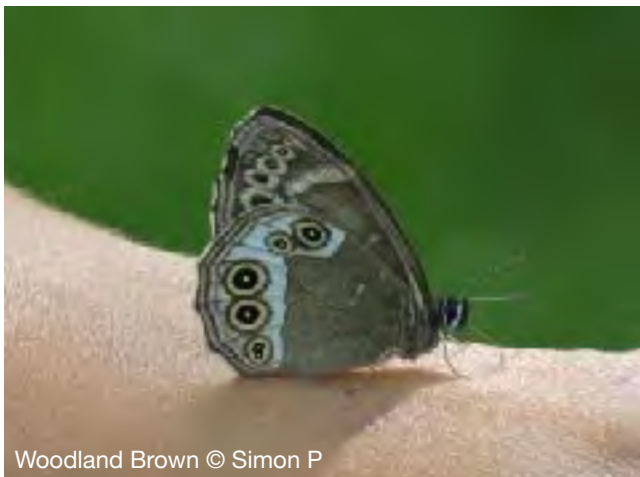
Woodland Brown © Simon P