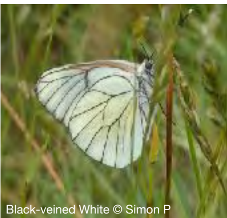
Black-veined White © Simon P