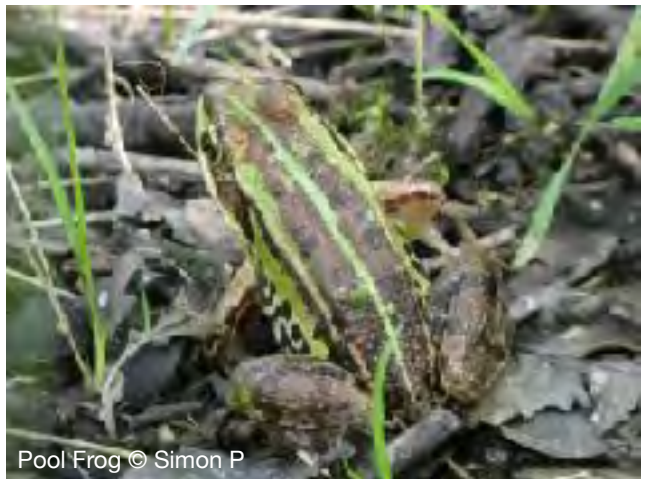
Pool Frog