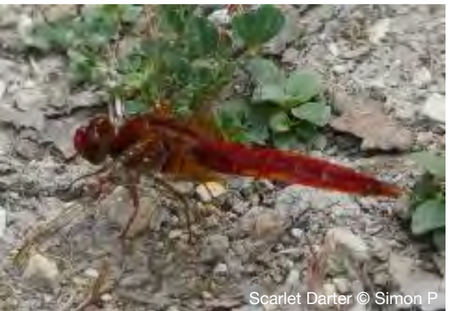
Scarlet Darter