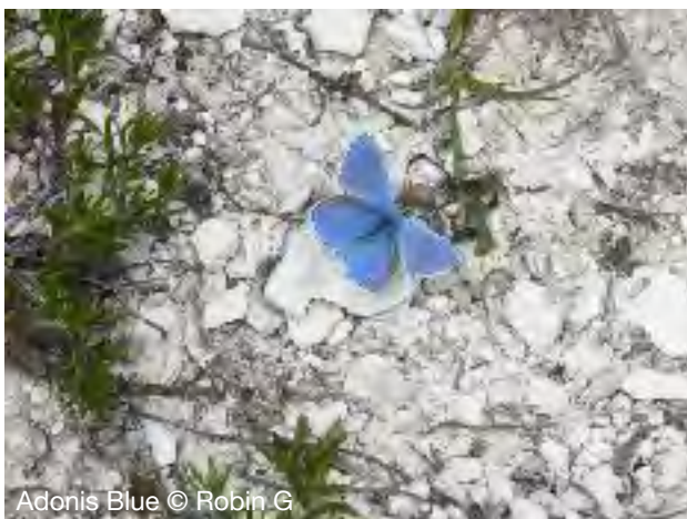
Adonis Blue

It was time to leave the nesting Whiskered Terns to their thousands of white water-lilies and we headed to our next stop. En route, a brief comfort stop found us a beautiful Short-toed Eagle, gliding above the village in search of a snake to feed on.