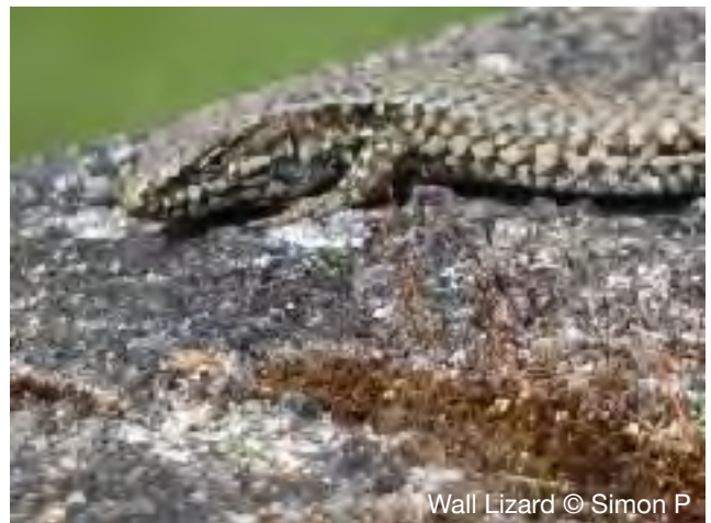
Wall Lizard