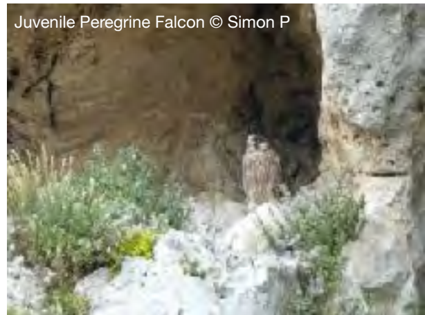
Juvenile Peregrine Falcon

Our eyes full of botanical wonders, we drove a further five minutes down the road to enjoy some impressive limestone cliffs. Robin spotted another White Admiral butterfly which allowed our eyes to fall upon a lovely Blue Chaser dragonfly. Finally, as we headed back to the bus, a Peregrine Falcon gave us the best show; an adult came prey-bearing to feed its chicks in the nest. We had excellent views of this brief family reunion and were able to admire the plumage of a juvenile bird waiting on the ledge.