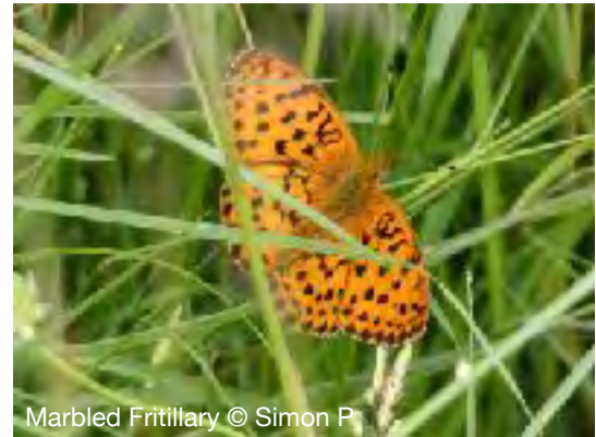
Marbled Fritillary

Emilie drove us to a different lake this morning. We caught up with the famous Brenne Orchid in the marshes and also found ourselves a few Southern Bluets (Southern Damselfly). As we were arriving near the car park, we saw our first Hobby and getting out of the van once parked up Judy shouted "Turtle Dove", it was a delightful moment to listen to it purring away so close to us. The woodland walk to the lake produced many great dragonflies and damselflies. We saw Downy Emerald patrolling at 50cm from the ground in a marshy area. Very quickly we got Large-Red Damselfly and plenty of Azure Bluets and Common Blue-tailed Damselflies. A Hairy Hawker flew past us. Green-eyed and Blue-eyed Hawkets were patrolling over the grassland ride running parallel to us. Simon also spotted another beautiful insect flying right above our heads: an Orange-Spotted Emerald. Butterflies were also present with Marbled Fritillary and many Black-veined White. We fell upon a couple of male Stag Beetle unfortunately half eaten by birds or bats.