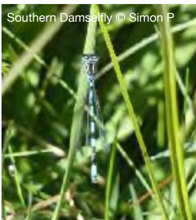
Southern Damselfly © Simon P