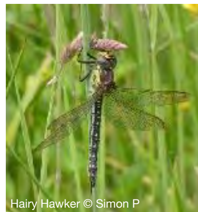
Hairy Hawker