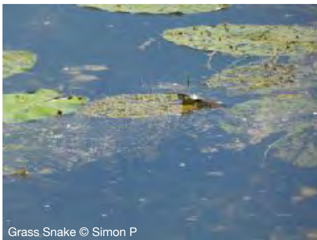
Grass Snake