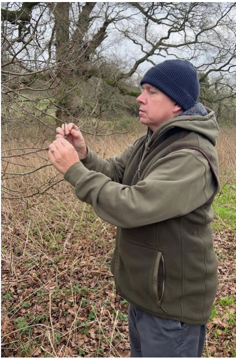
Searching for Purple Hairstreak eggs

Having retired from a 35-year career in IT in 2021, I now work as an independent ecologist and website developer. Having focused on butterfly life cycles, and then butterfly rarities, I'm now particularly interested in the plants used by butterflies and other Lepidoptera. As a Greenwings guide, all of these interests allow me to help guests see the 'bigger picture' of butterfly ecology, thereby enhancing their experience. It's certainly more interesting and enjoyable than simply ticking species off a list, in my opinion!