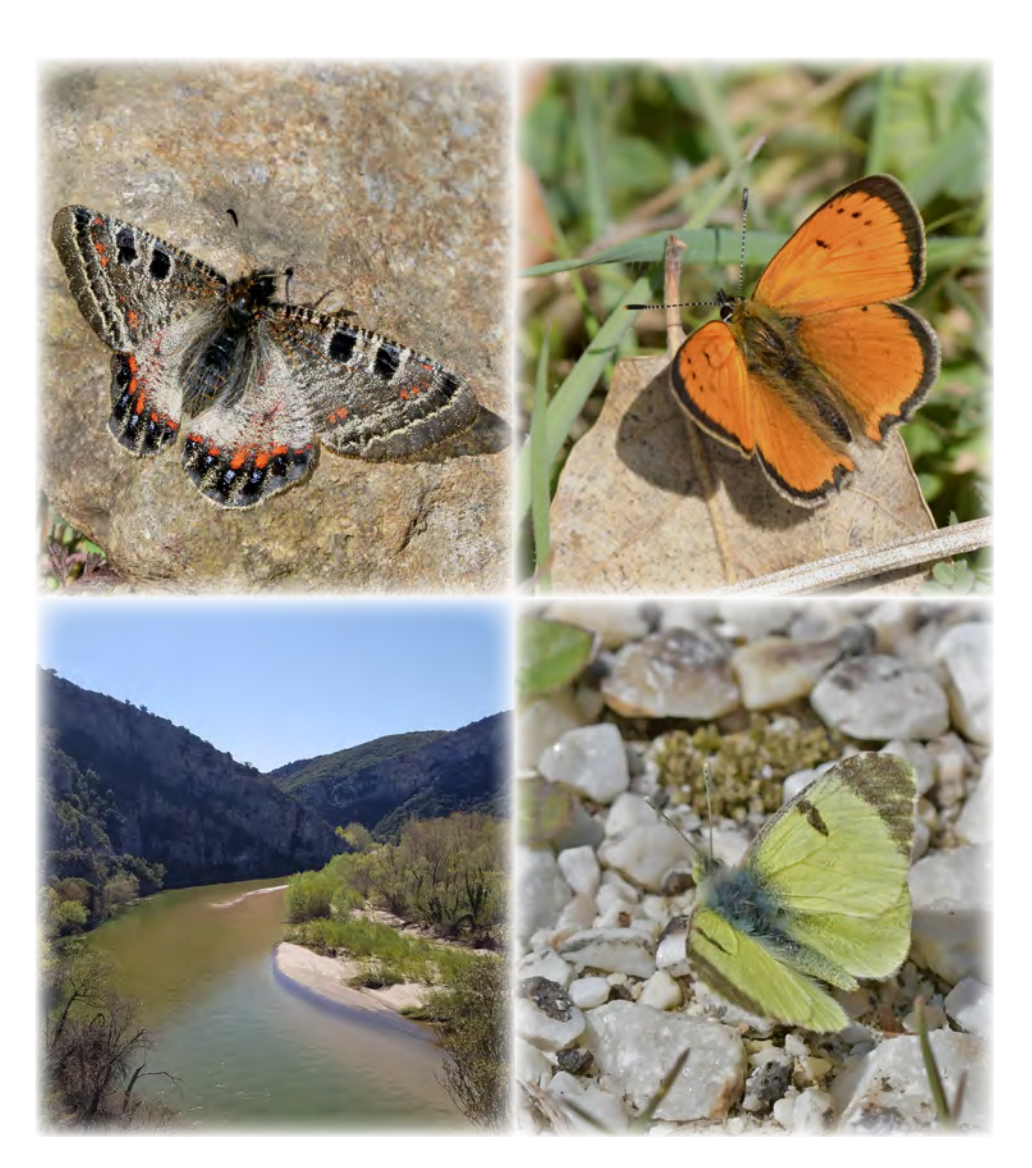
Greenwings Wildlife Holidays

Tel: 01473 254658 Web: www.greenwings.co.uk Email: enquiries@greenwings.co.uk