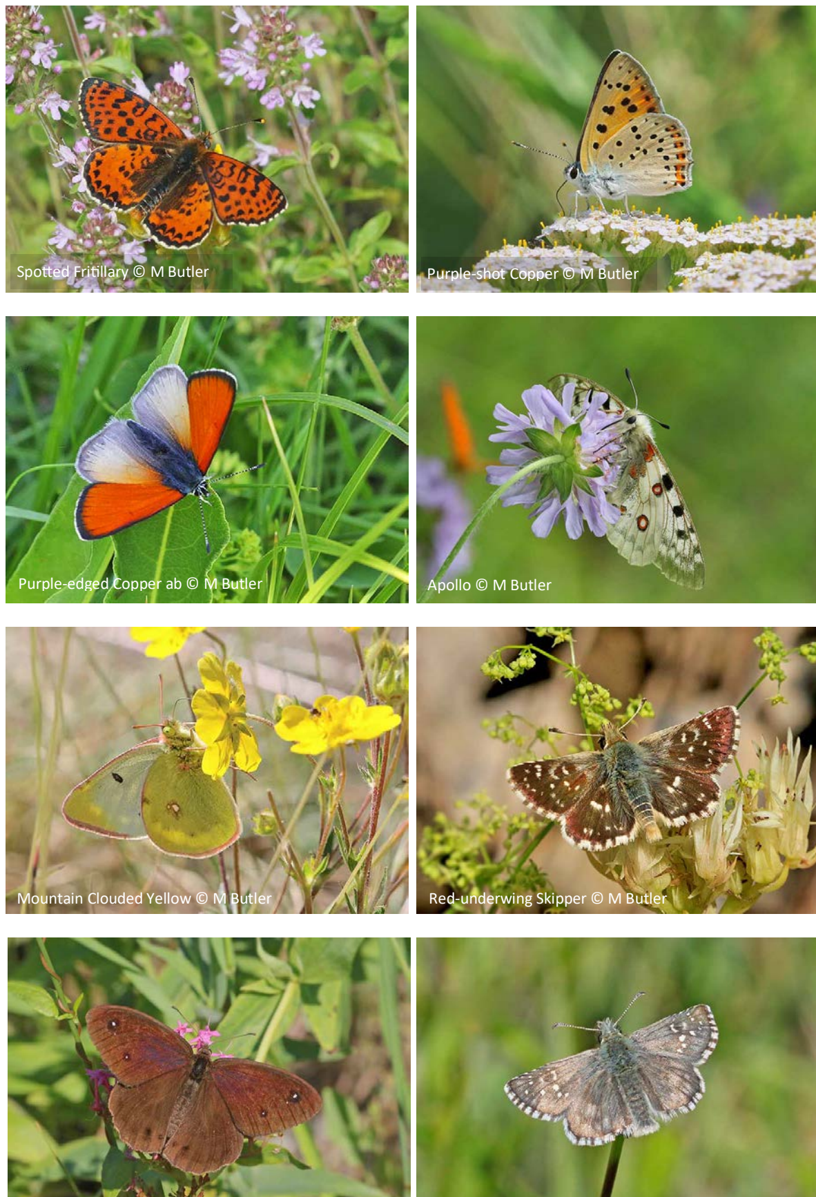
Dusky Grizzled Skipper