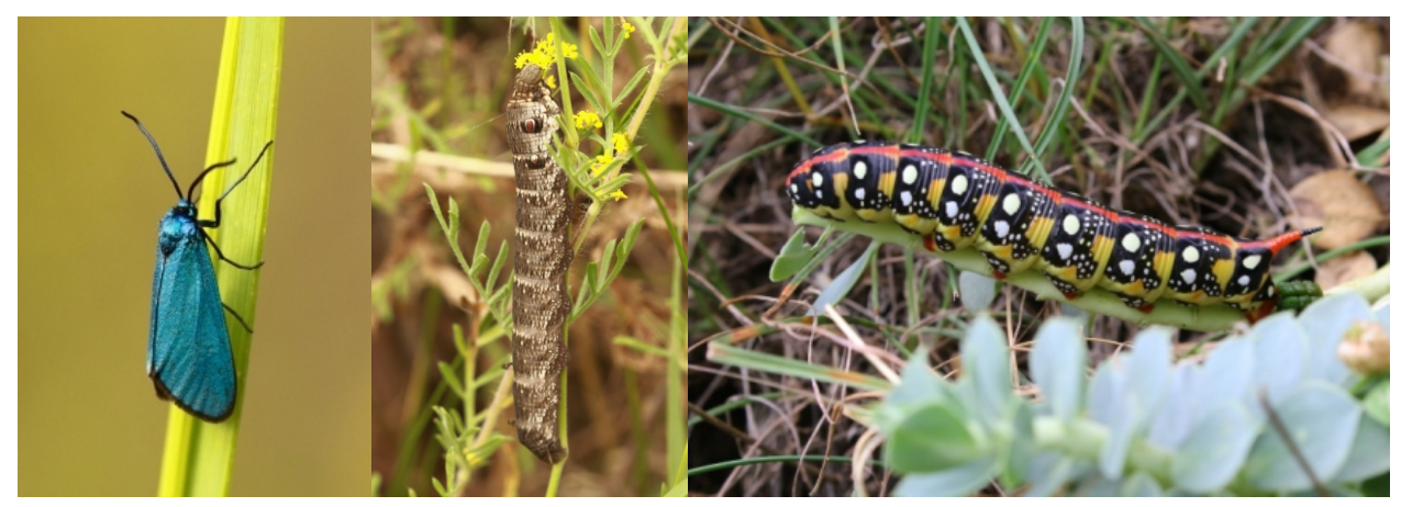
Adscita mannii