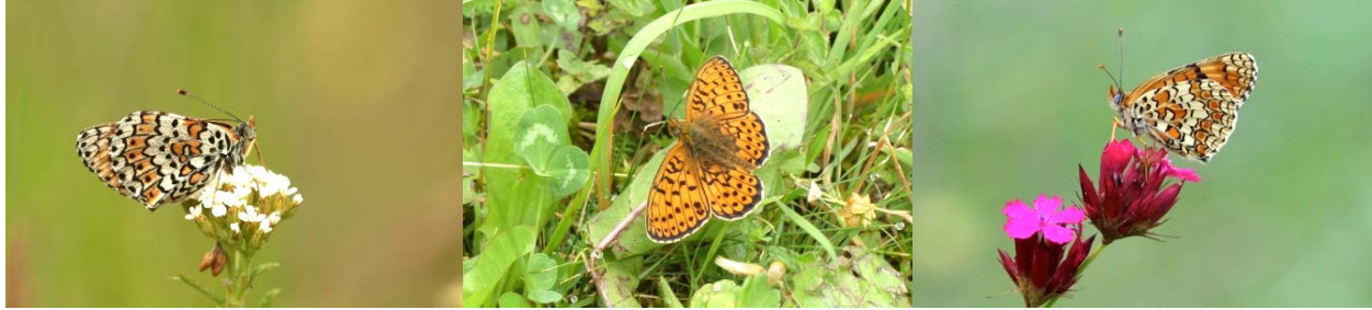
Glanville Fritillary