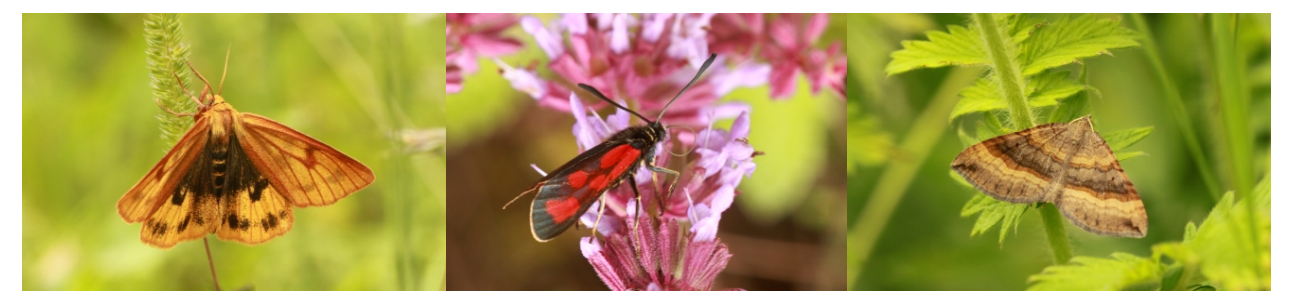
Clouded Buff