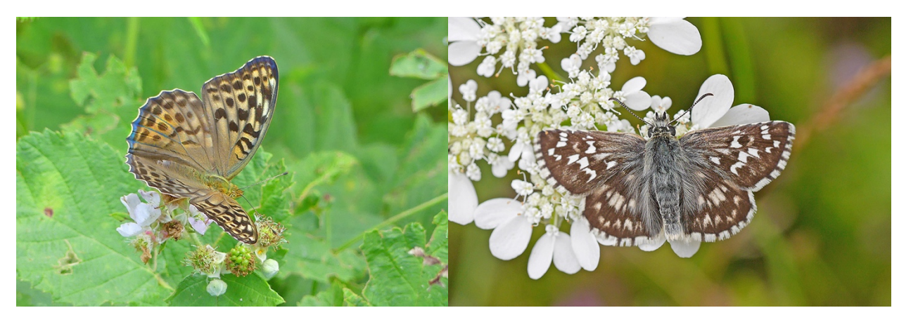
Silver-washed Fritillary 'Valezina'