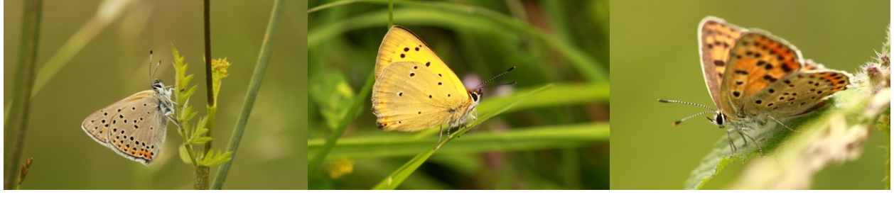
Balkan Copper © S. Gigov