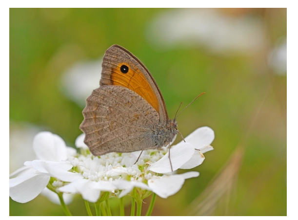
Oriental Meadow Brown