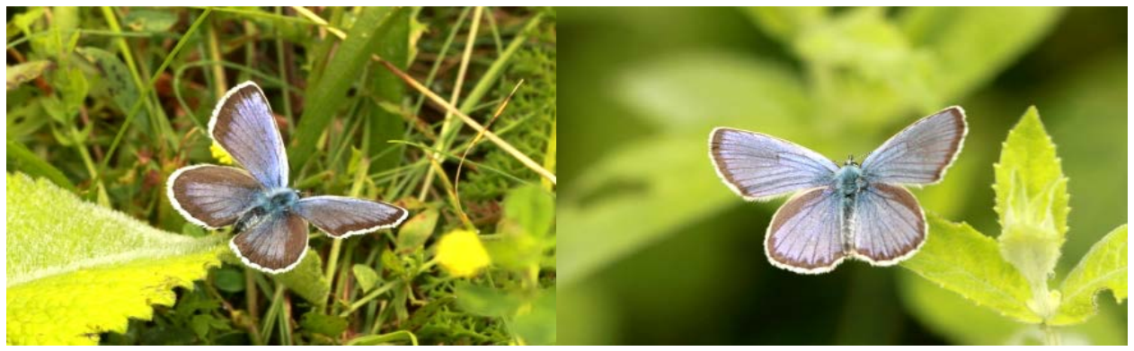
Silver-studded Blue