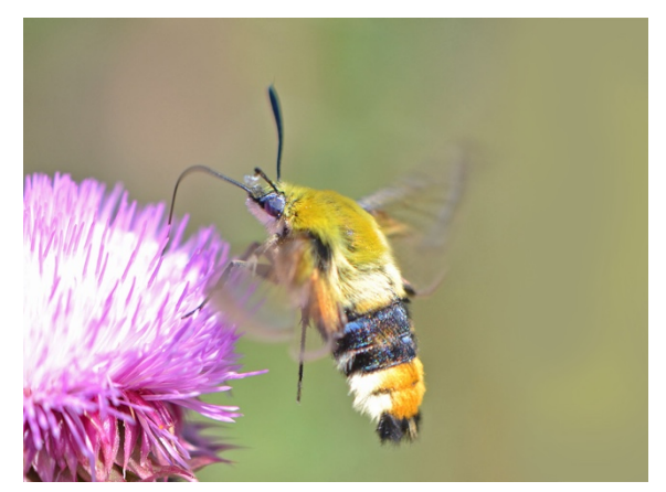
Narrow-bordered Bee-hawk