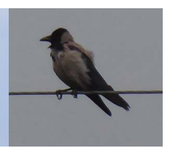
Hooded Crow