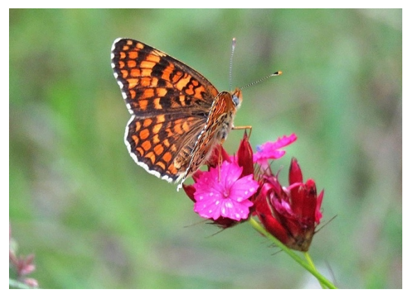
Knapweed Fritillary © N. Branson