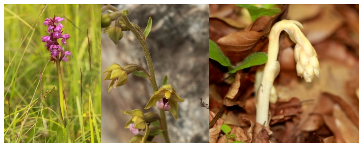
Heart-shaped Lip Dactylorhiza