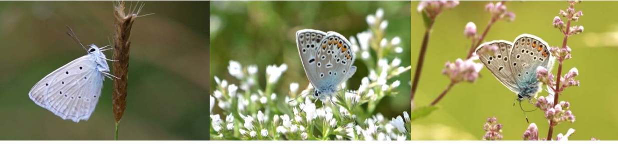
Meleager's Blue © A. Ashworth