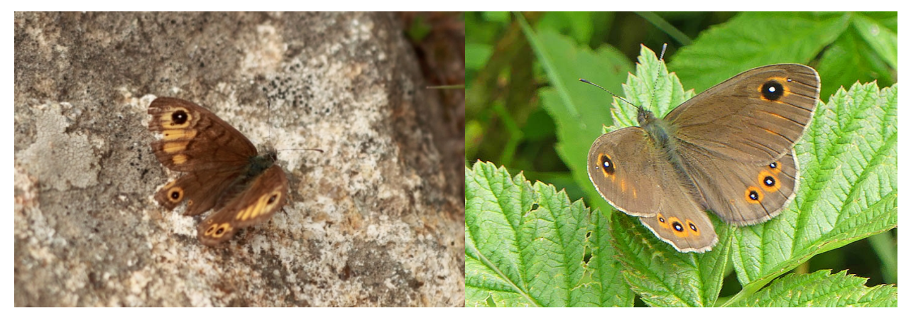
Northern Wall Brown