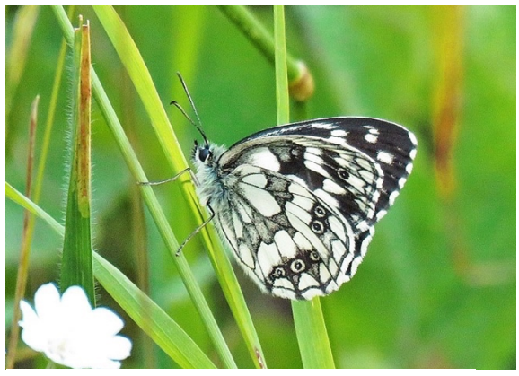
Marbled White