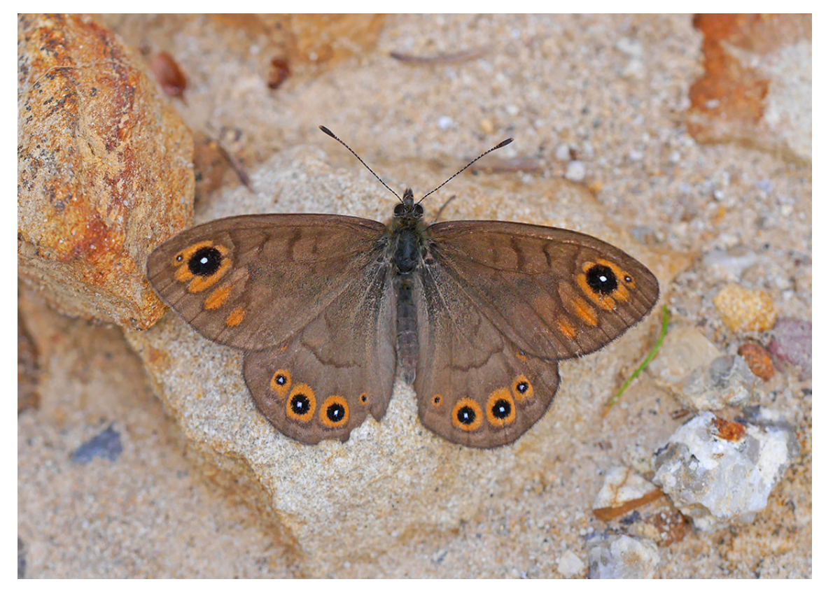
Northern Wall Brown