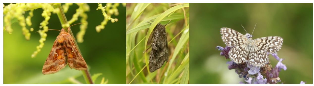
Above left to right : Plain Golden Y, Great Brocade & Latticed Heath