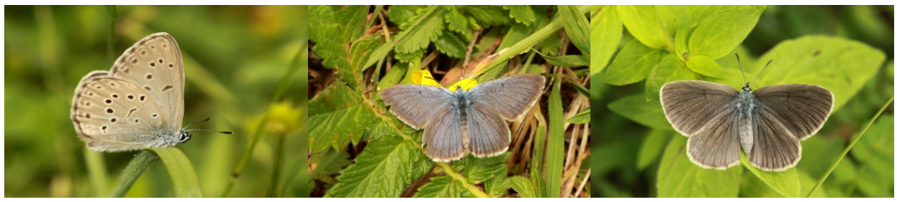
Underside Alcon Blue