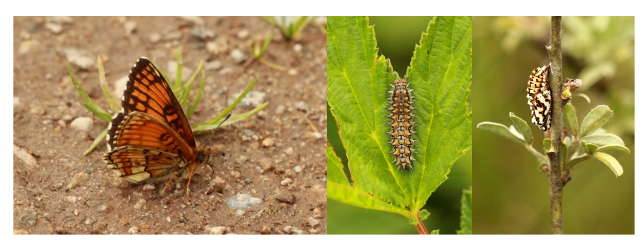
Heath Fritillary stages Above left imago aberration. Centre larva. Above right chrysalis