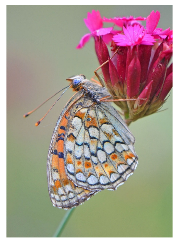
Niobe Fritillary