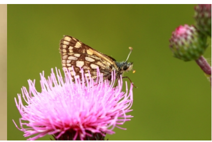
Chequered Skipper