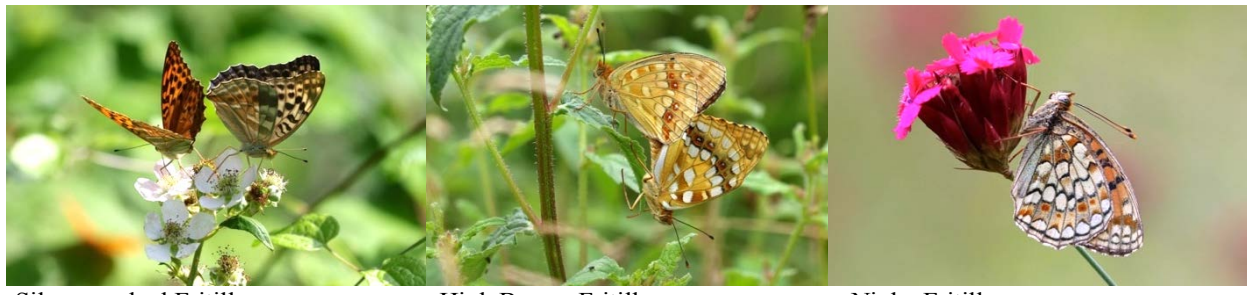
Silver-washed Fritillary