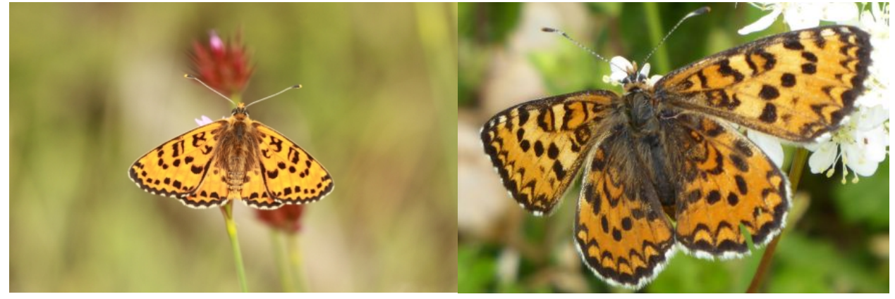
Spotted Fritillary