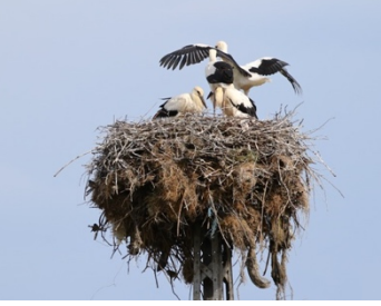
Nest of White Stork & Spanish Sparrows