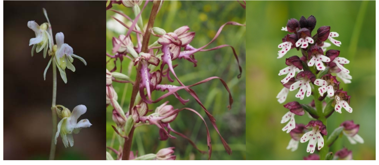
Ghost Orchid