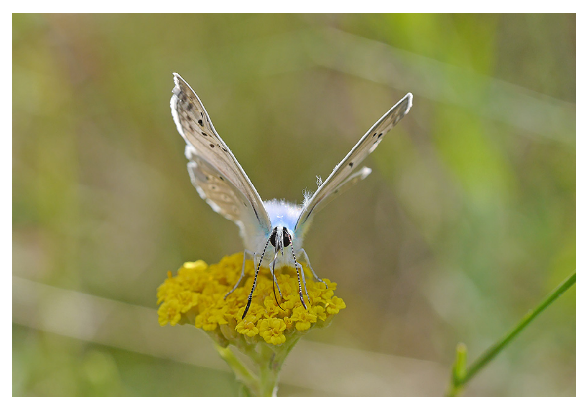
Meleager's Blue (male) © D. Wright