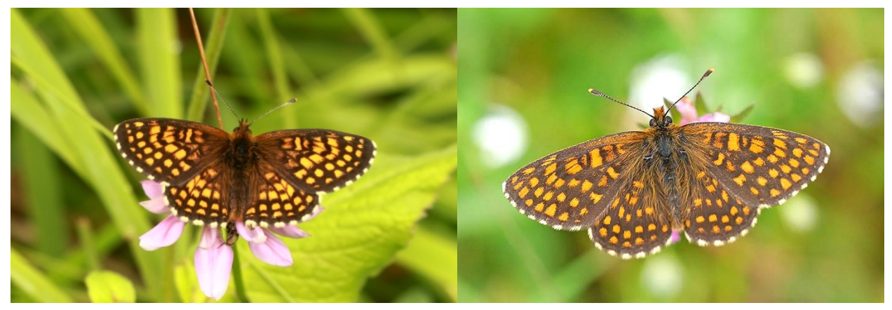
Heath Fritillary