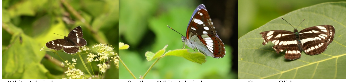
White Admiral © S. Gigov