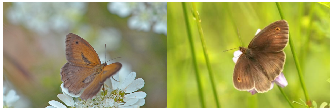
Oriental Meadow Brown