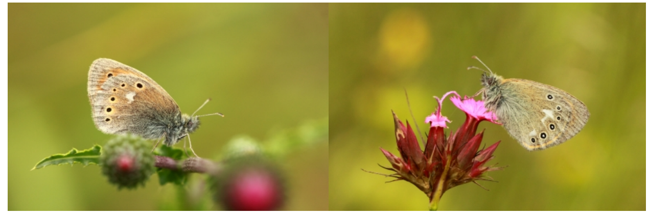
Eastern Large Heath