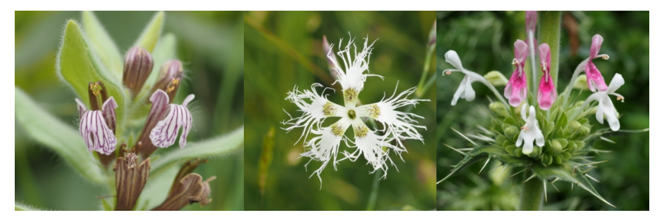
Ajuga laxmannii