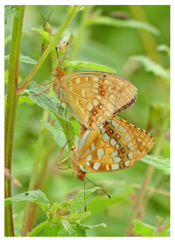
High Brown Fritillary