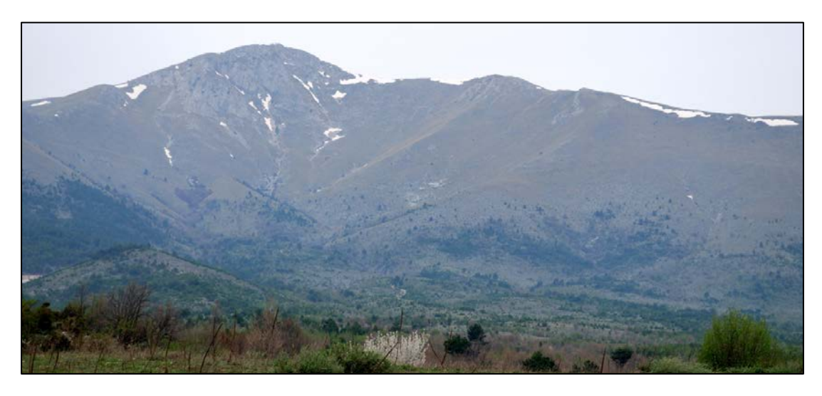
Orvilos: Tsolias Peak, 2213m

Our last day in the field was an adventurous trip to the nearby mountain of Orvilos (Tsolias Peak, 2213m). Our route took us away from Falakro, through some agricultural valleys and up again past some very remote villages with only the occasional need to retrace our steps to regain the right road. The mountain of Orvilos straddles the Greek Bulgarian border and is unusual because the higher reaches of limestone grassland are not grazed.