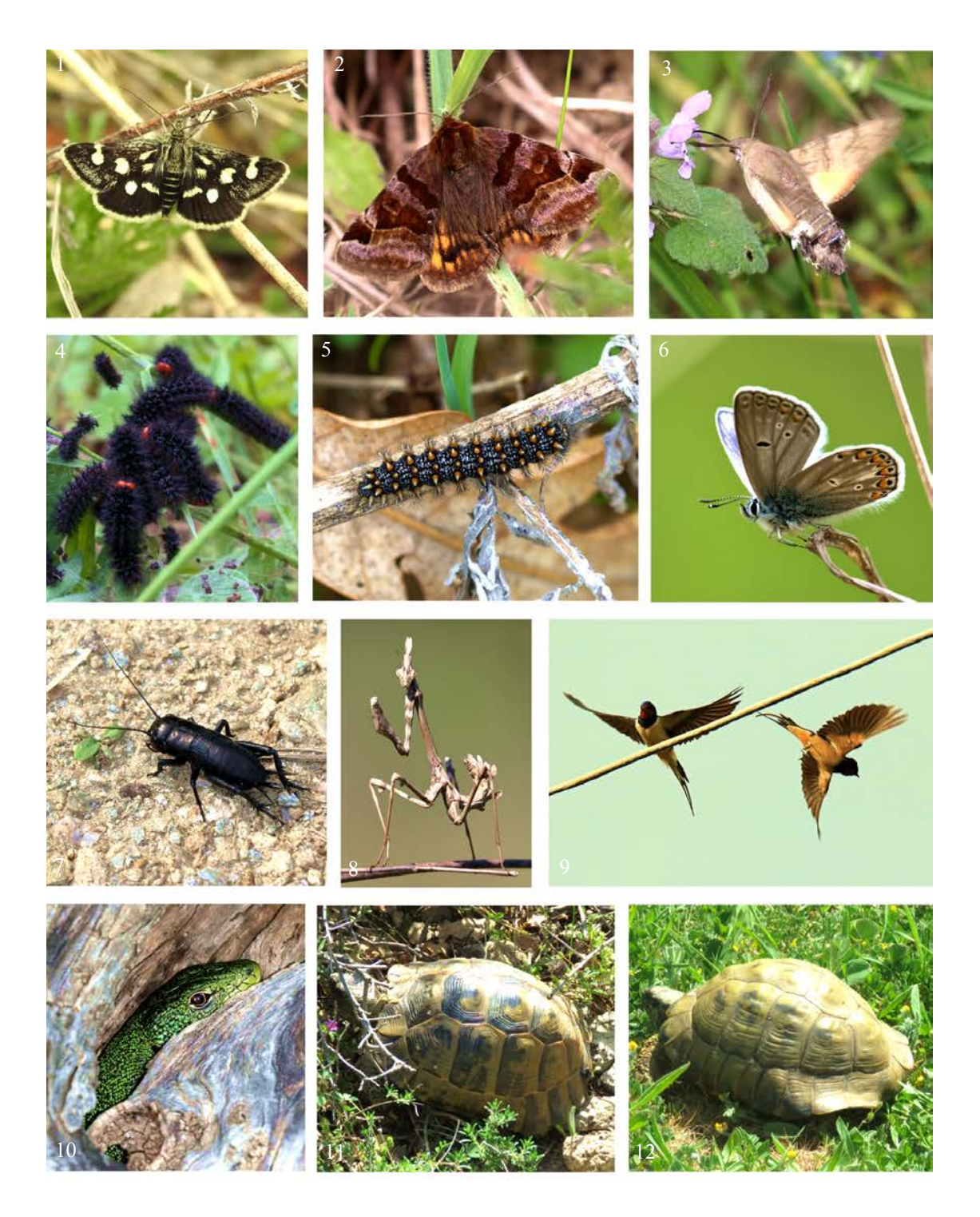
1. Pyralidae, Eurryhpis polinaris (Thomas Gerwing); 2. Burnet Companion, Euclidia glyphica; 3. Hummingbird Hawkmoth, Macroglossum stellatarum (Ken Elsom); 4. Glanville Fritillary caterpillars, Melitaea cinxia (Hilary Raeburn); 5. possible Knapweed Fritillary caterpillar, Melitaea phoebe; 6. abberant Common Blue, Polyomattus icarus (Harry Clarke); 7. cricket nymph (Gillian Elsom); 8. Empusa mantid nymph (Ken Elsom); 9. Swallows (Michael Dolderer);