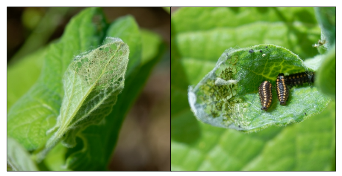
Harry Clarke: False Apollo caterpillar nest (left) & caterpillars (right) on A. hirta

Continuing the caterpillar hunt, we were able to see Black-veined white larvae but the dramatic adults are on the wing much later. Glanville Fritillary caterpillars were wandering around as usual. Grecian Copper was by now a frequent sight along with Small Copper, Green Hairstreak, Holly Blue and Brown Argus. Grizzled skipper was present along with Marbled Skipper. Among the Whites, Orange Tip was common along with Eastern Dappled White. The 'whites specialists' showed photo-confirmation of Southern Small White, in amongst the 'ordinary' Small White, Large White and Green-veined White. In such an under-recorded region, all records are valuable data.