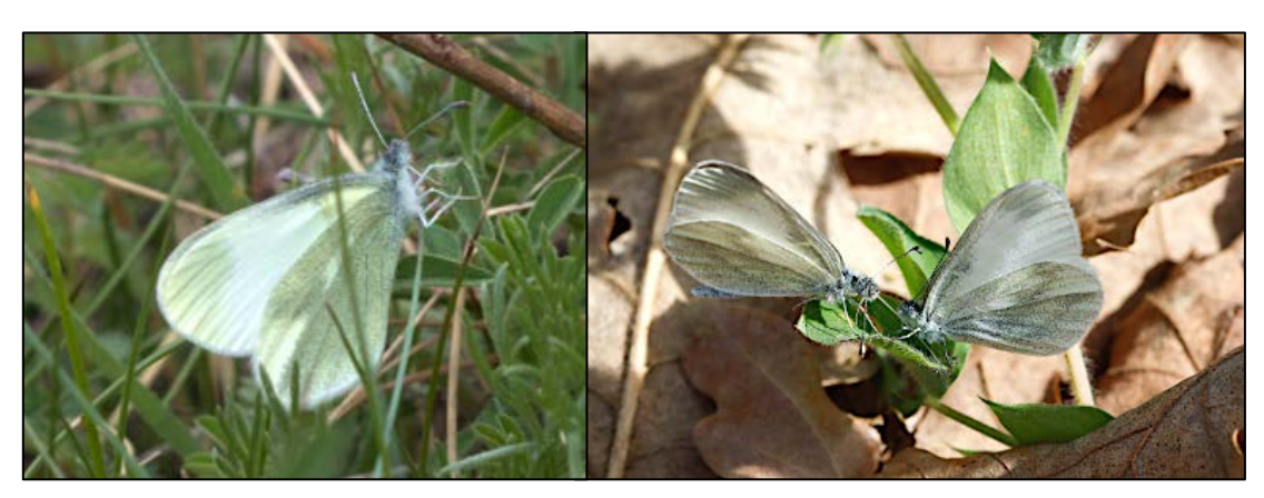
David Coupe: Eastern Wood White (left) & Wood White pair (right)

We pushed on to another site in search of more Eastern Festoons, which were still found only in very low numbers. Unfortunately the winter rains had completely blocked with debris and mud the road access to the forest site of our destination. Nevertheless Harry managed to rapidly survey around with his camera and get photos of a pair Wood White here, which we could later also clearly identify as Eastern Wood White. Whites were now a firm theme! Time was running out for the day and after a short stop we made a reluctant return to the hotel for a badly needed rest before dinner.