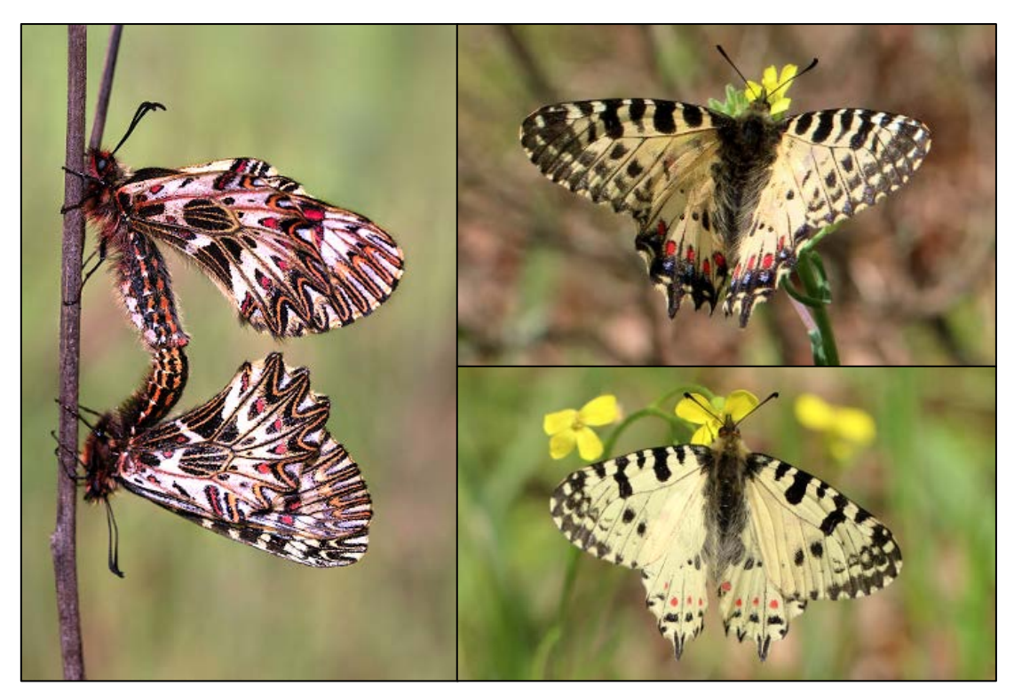
Trevor Davenport: Southern Festoon