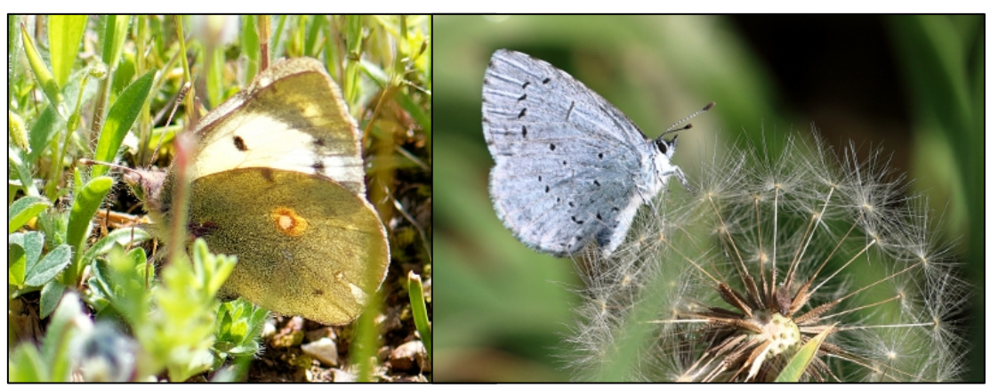
Harry Clarke: Berger's Clouded Yellow

Today we would visit a range of coastal sites and some rocky grassland locations in search of that elusive Eastern Bath White. Our first destination was in the foothills of the Ismaros Hills right beside the sea at Mesembria. This is an idyllic, long pebbly beach behind which the low limestone hills are covered in prickly Oak maquis. Although frequently grazed by goats the almost impenetrable thorny maquis protects a rich and varied vegetation. Almost everywhere here are ancient sites from classical times. In the overgrown fields and maquis are some old trees of Valonia Oak ( Quercus ithaburensis ) and Thrace has one of its few remaining Greek strongholds.