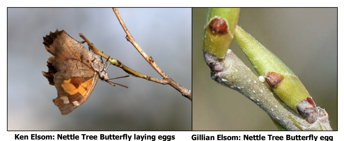
Day 2: 10th April 2018

The wonderfully weird Nettle Tree Butterfly put in an appearance and its host plant Nettle Tree is frequent at the site. Indeed Gillian and Ken observed Nettle Tree butterfly laying an egg at the tip of a twig close to a couple of swollen leaf buds. Common Swallowtails flitted around in the late sunshine along with Queen of Spain Fritillary, Eastern Dappled White Clouded Yellows and Orange tip. Our adventure had begun!