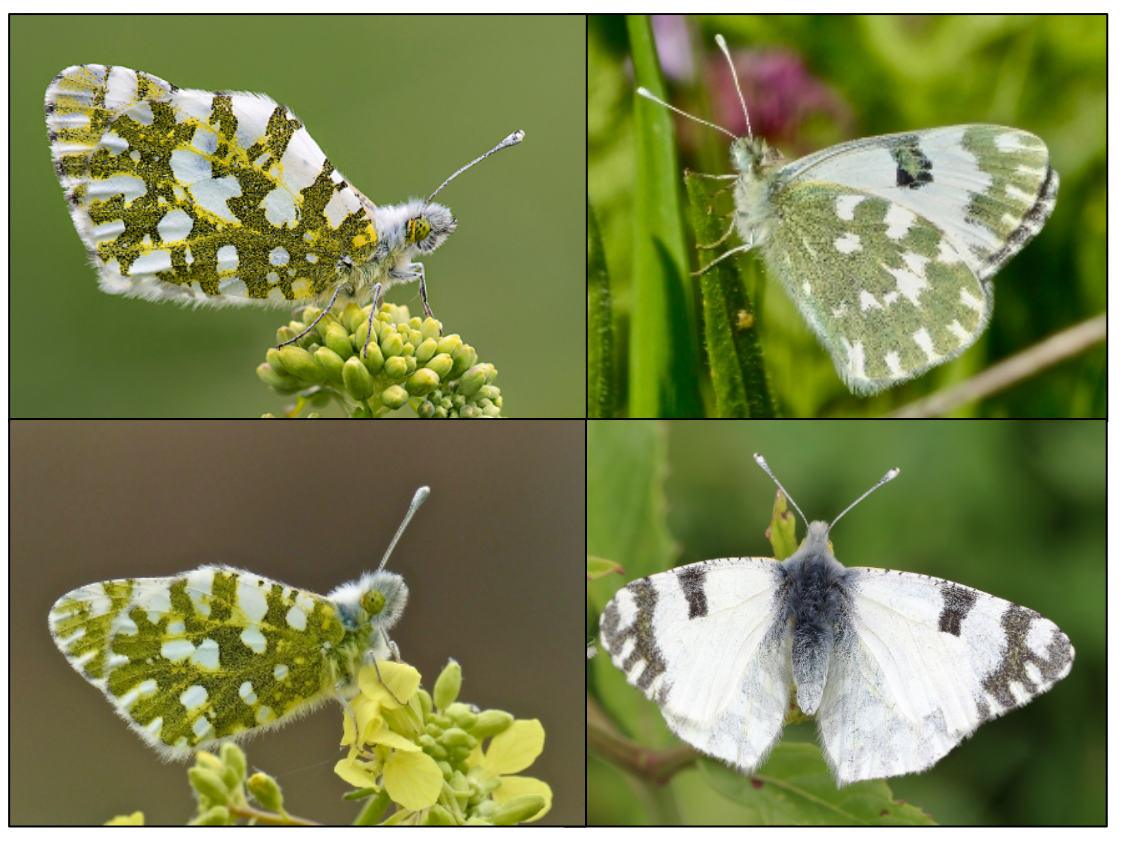
Trevor Davenport: Orange Tip Dan Danahar: Eastern Bath White

Dan Danahar: Eastern Dappled White Gillian Elsom: Eastern Dappled White