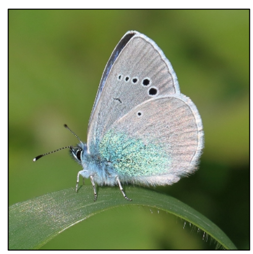
Gillian Elsom: Green Underside Blue

season. Although both Grecian Copper and Eastern Dappled White were flying around, we soon found ourselves investigating the hills. A first stop was in higher ground at an open rocky area along one of the main river valleys of the area where Eastern Strawberry Tree ( Arbutus andrache ) meets forests of Hungarian Oak ( Quercus frainetto ). Unfortunately no Eastern Bath Whites were seen in a known breeding locality. Despite that we embarked on a master-class in spotting and identification of obscure whites. The Eastern Dappled White proved more common than the rarer