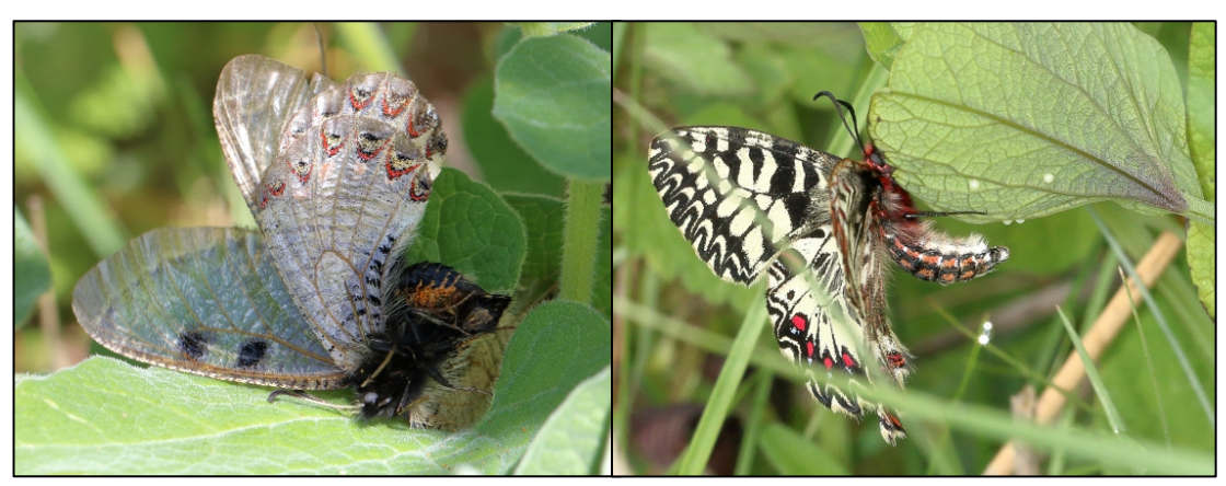
Gillian Elsom: False Apollo mating pair

We were also able to find False Apollo eggs on Aristolochia hirta and indeed some caterpillars of False Apollo in a number of "nests" on A. rotunda, where young caterpillars had sewn together a couple of developing leaves and were already feasting away. Many of the earliest caterpillars take refuge in the dark coloured flowers of A. hirta . The caterpillars feed up rapidly and then wander off and pupate in the soil for protection during the dry summer and cold winter, unlike Southern Festoon which spins a cradle on a stem or twig and remains above ground until the following spring.