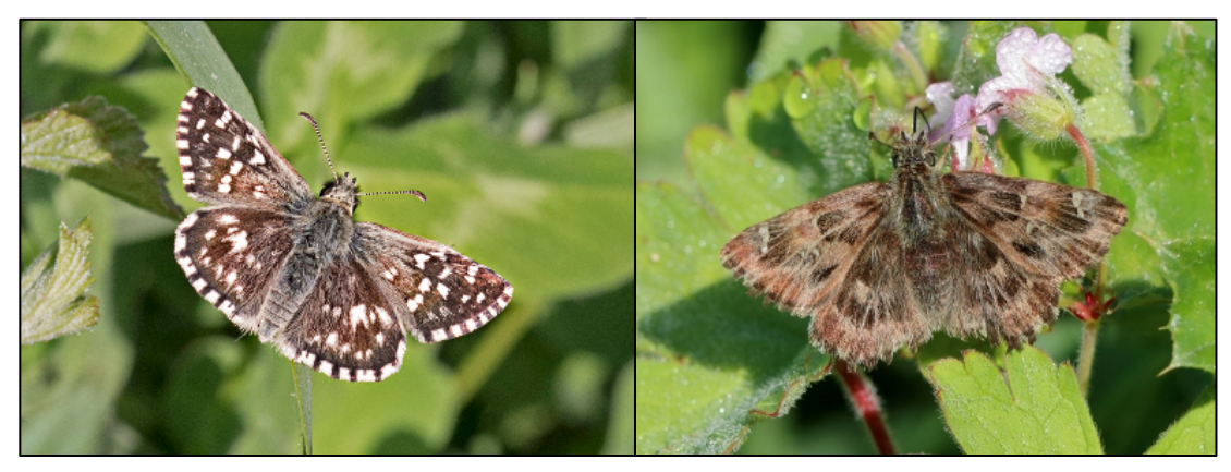
Trevor Davenport: Grizzled Skipper

Continuing the caterpillar hunt, we were able to see Black-veined white larvae but the dramatic adults are on the wing much later. Glanville Fritillary caterpillars were wandering around as usual. Grecian Copper was by now a frequent sight along with Small Copper, Green Hairstreak, Holly Blue and Brown Argus. Grizzled skipper was present along with Marbled Skipper. Among the Whites, Orange Tip was common along with Eastern Dappled White. The 'whites specialists' showed photo-confirmation of Southern Small White, in amongst the 'ordinary' Small White, Large White and Green-veined White. In such an under-recorded region, all records are valuable data.