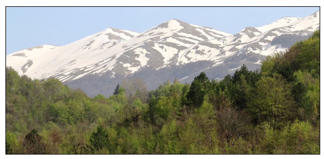
Ken Elsom: Snow covered peaks and forested foothills of Mt. Falakro

After a good night's rest and a hearty country breakfast we were ready to see what the mountains had in store for us as a contrast to the lowlands of the Eastern Rodopi. It was still early and rather cool, so our first stop was the sunniest location just fifteen minutes from the hotel on a limestone rocky headland at about 980m altitude.