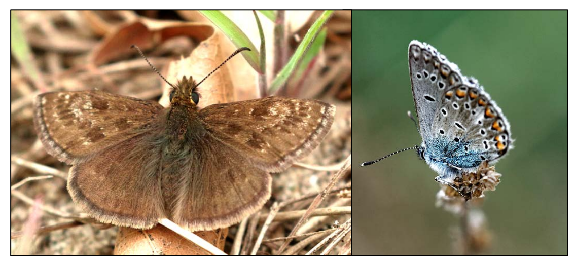
Ken Elsom: Dingy Skipper

Our trip back to Falakro was broken by a low altitude (400m) stop near to the village of Potamoi, along the Dopsatos river, a tributary of the now-damned Nestos river. Here in a field next to the river a strong colony of Dingy Skipper provided us with an additional species. Speckled Wood was also a first for the trip showing the season marched on! Gruner's Orange Tip was also present along with Orange Tip. Eastern Baton Blue was evident along with Green-underside Blue. Scarce and Common Swallowtails were also seen along with Large Tortoiseshell, Comma, Peacock, Brimstone and Eastern Wood White. The strangely marked Burnet Companion Moth posed for a photo and after getting our own group photo we brought our field work for the trip to an end and returned to the hotel.