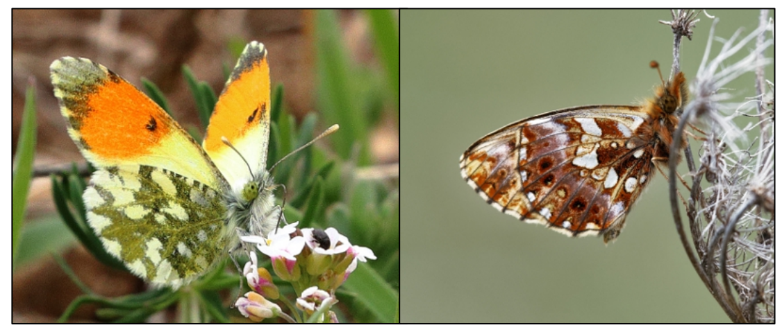
Ken Elsom: Gruner's Orange Tip