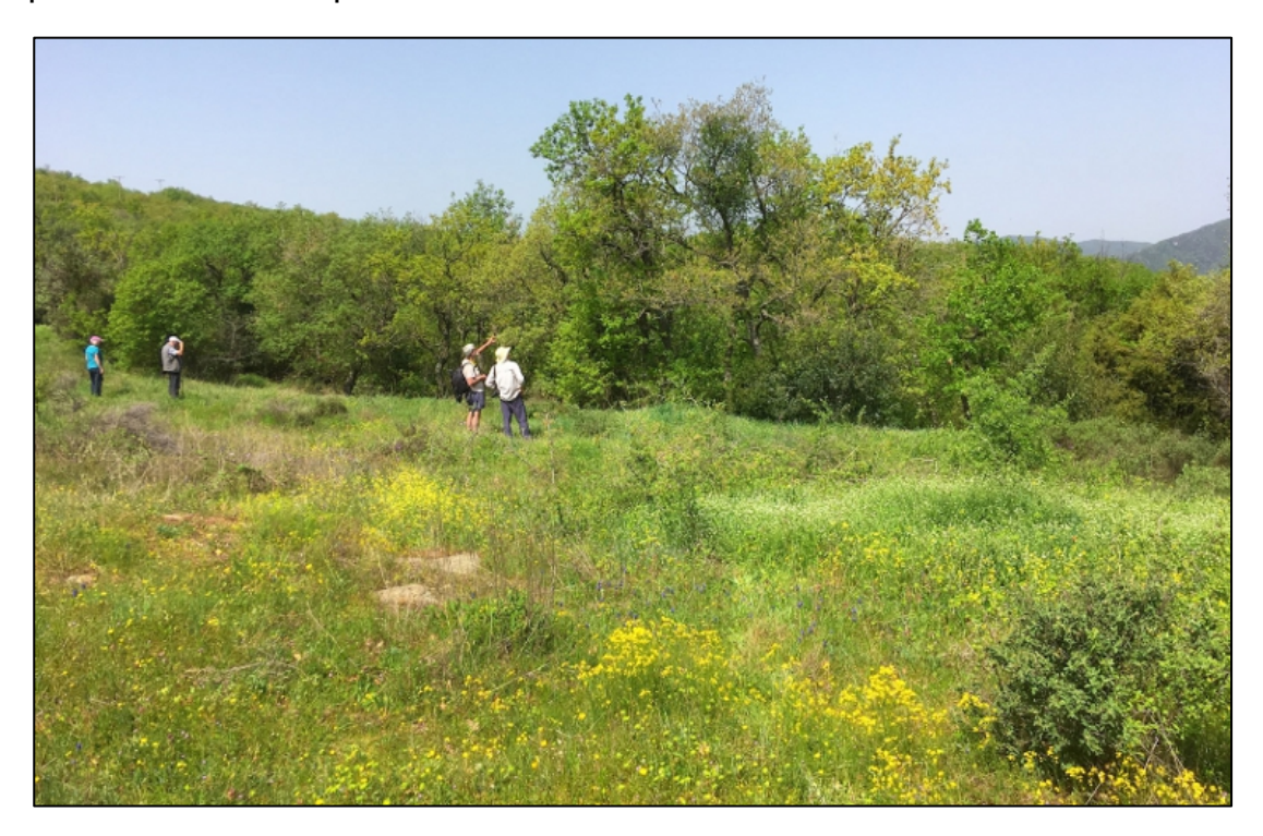
Hilary Raeburn: Clearing in oak forest with False Apollo

This was the day to leave our hotel in Alexandroupoli and move inland and upwards to our next base in the Western Rodopi Mountains. A discussion during dinner the previous evening made it clear that the whole group really wanted another opportunity to visit our very special site for False Apollo, where it was in such abundance. Quite rightly, as it was simply too good an opportunity to miss. A quick change in the agenda allowed us to spend most of the day at that wonderful location before eventually journeying on to our second hotel. With the warm morning sunshine on our backs we checked out of the first hotel and headed to the now familiar ground where we were greeted once again by a profusion of False Apollos.