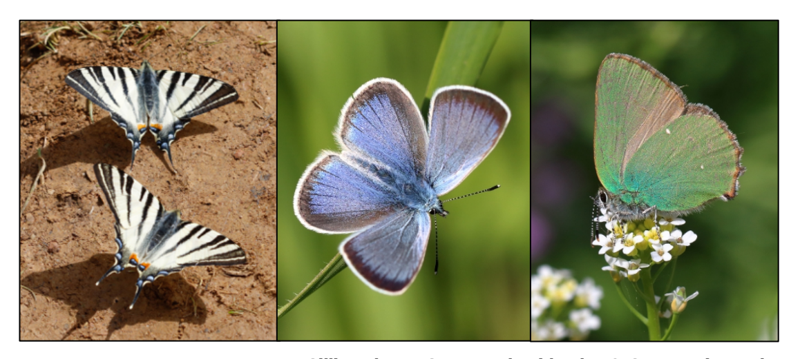
David Coupe: Scarce Swallowtail Gillian Elsom: Green Underside Blue & Green Hairstreak

A little further on we stopped at a stream bed running through thick Maquis just in sight of the sea. Here Southern Festoon greeted us again and Grecian Coppers showed themselves to be widespread in the area. Scarce Swallowtails provided a bit of drama amongst other common early spring butterflies such as Green Hairstreak, Orange Tip, Brown Argus Common Blue, Green-underside Blue, Small Copper, Queen of Spain Fritillary, Wall Brown, Clouded Yellow and Mallow Skipper.