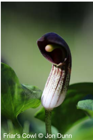
Friar's Cowl