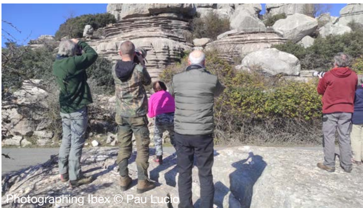
Photographing Ibex