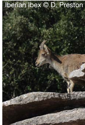
Iberian Ibex