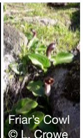
Friar's Cowl