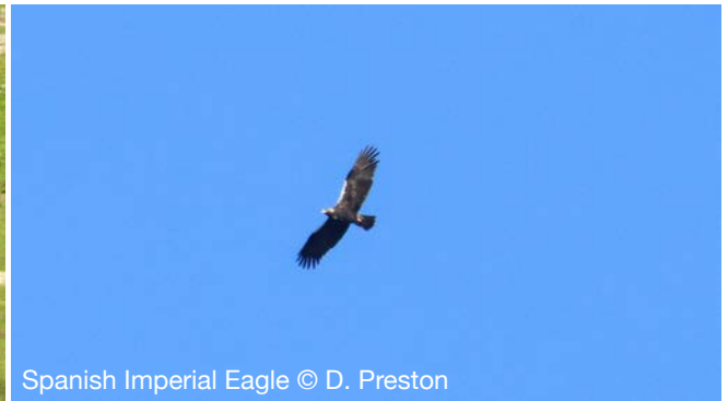
Spanish Imperial Eagle