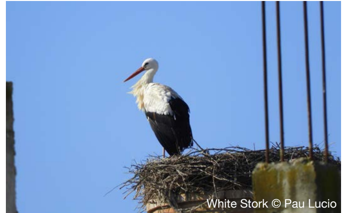
White Stork