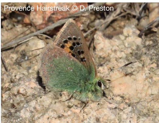
Provence Hairstreak

We moved to the end of the road for lunch overlooking a large reservoir, with Spanish Imperial Eagles flying high overhead as we ate our bocadillos in the warm sunshine. After lunch, dropping down to the dam that