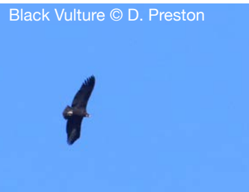
Black Vulture