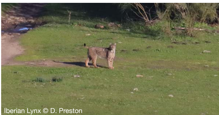
Iberian Lynx