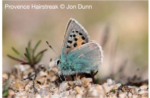
Provence Hairstreak