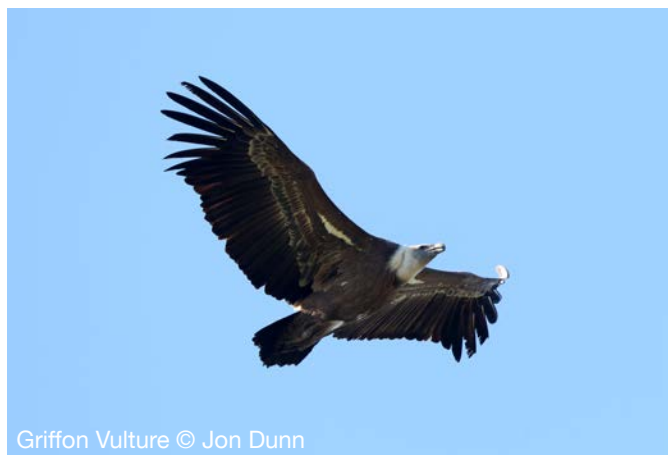
Griffon Vulture

The day that followed was lynx-free, though far from uneventful. Fernando and Inma explained how the cats were most active in the hours of dawn and dusk, preferring to hunt their favoured prey, rabbits, during those crepuscular times. The height of the day would usually see them settled somewhere peaceful and out of sight. We, meanwhile, were distracted largely by the wildlife – the birding here was to prove to be excellent, not least as a succession of raptors soared over the hilltops around us. Some 40 Griffon Vultures kettled