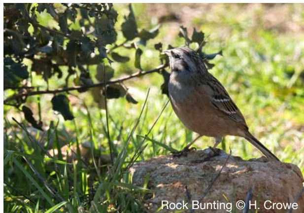
Rock Bunting

The birding was good here too – early triumphs being several Dartford Warblers and some confiding Rock Buntings.