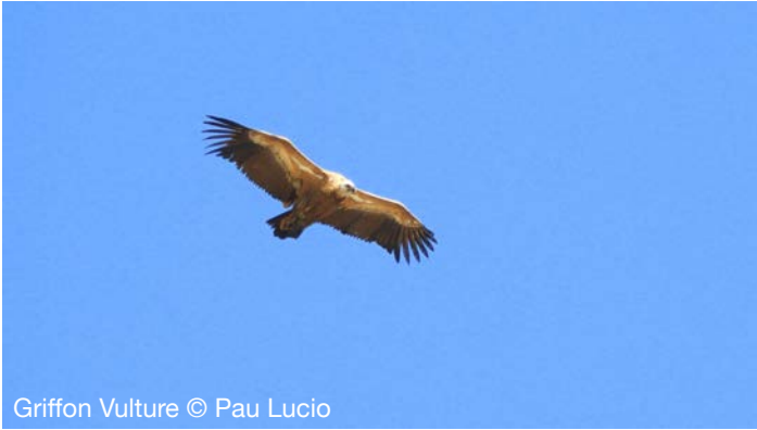
Griffon Vulture