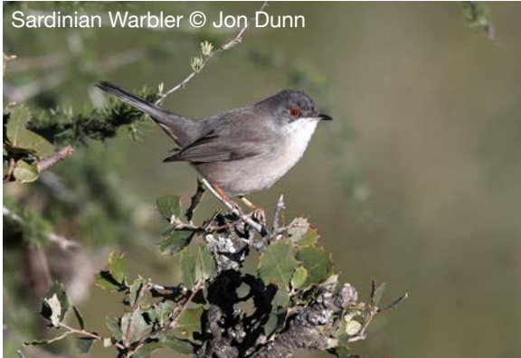
Sardinian Warbler