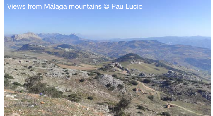
Views from Málaga mountains