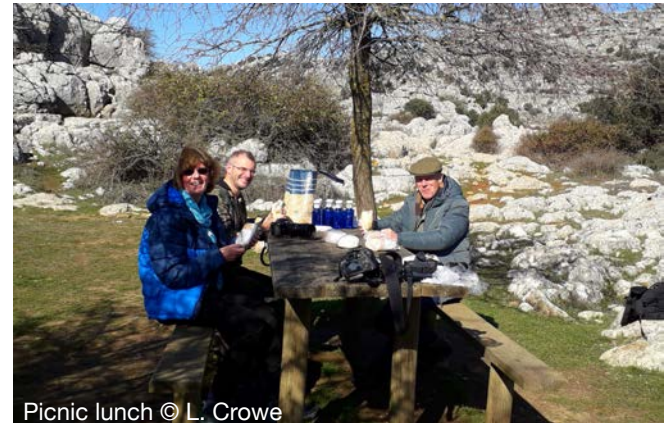
Picnic lunch