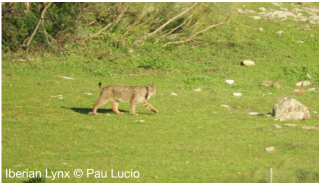
Iberian Lynx