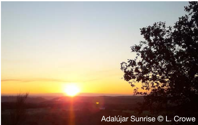
Adalújar Sunrise