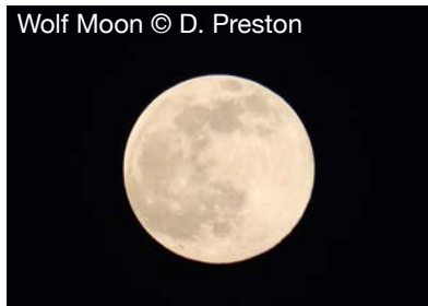
Wolf Moon