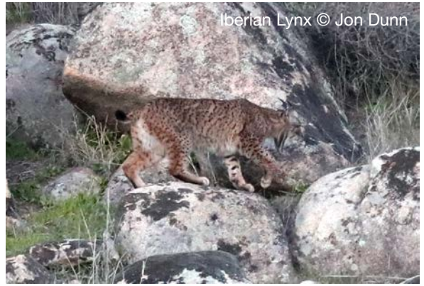
Iberian Lynx