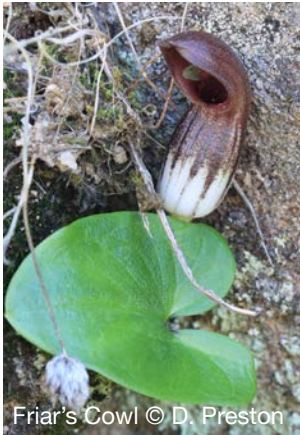
Friar's Cowl