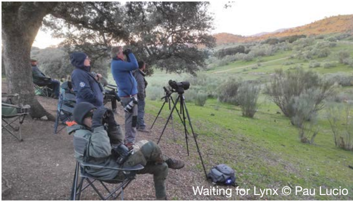
Waiting for Lynx