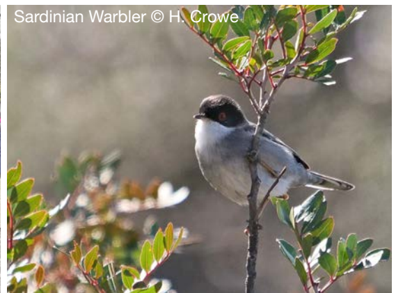
Sardinian Warbler