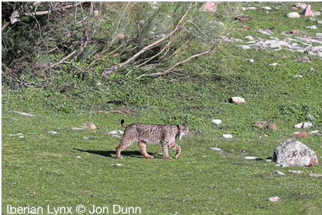
Iberian Lynx