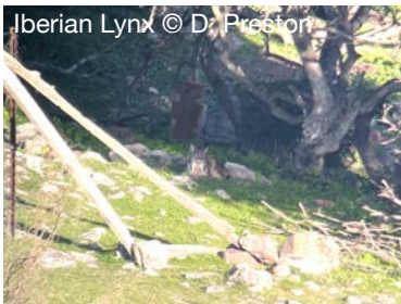
Iberian Lynx